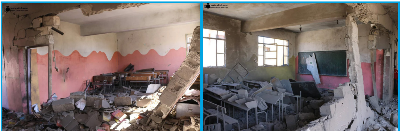
Destruction at Batabo School in the aftermath of an airstrike we believe was Russian in Batabo village, Aleppo – September 27, 2017

Wednesday, September 27, 2017, around 02:00, fixed-wing warplanes we believe were Russian fired a missile at Batabo School -known as Bara'em al Thawra School - in Batabo village, western suburbs of Aleppo governorate. The school building and its furniture were heavily destroyed , as the school was rendered out of commission . The village was under the control of ISIS at the time of the incident.