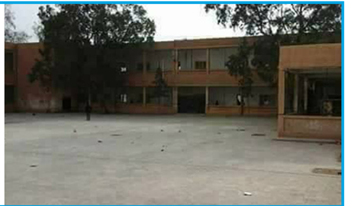
Fayeze Mansour school before August 11, 2017