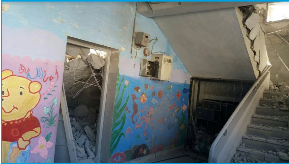
Damages at the Martyr Bashir Abdul Jawad School in the aftermath of an airstrike by Syrian regime forces warplanes in Hamouriya, Damascus suburbs – November 24, 2016

Friday, December 9, 2016, Syrian regime forces helicopters dropped a barrel bomb near Abdul Qader al Najjar School in al Jalloum neighborhood, Aleppo city, which resulted in a massacre. In addition, the school fence was partially destroyed, and its furniture and cladding materials were moderately damaged. The neighborhood is under the control of Syrian regime forces at the time of this writing, while it was under the control of armed opposition factions at the time of the incident.