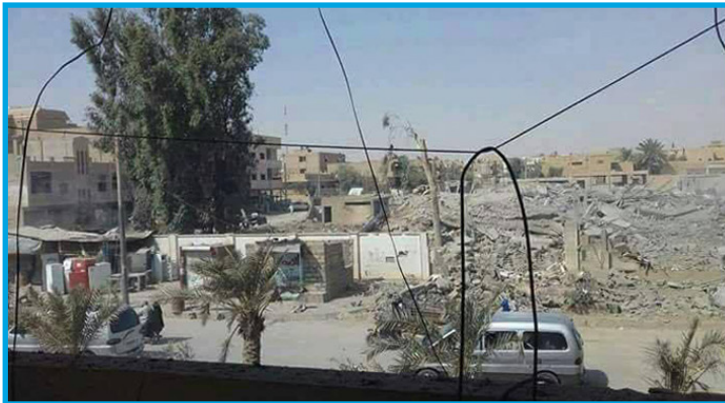
Destruction at the school in the aftermath of an airstrike by fixed-wing international coalition forces warplanes – August 11, 2017

Friday, August 11, 2017, fixed-wing international coalition forces warplanes fired a number of missiles at Fayeze Mansour School in al Boukamal city, eastern suburbs of Deir Ez-Zour governorate. The school building was destroyed completely, as the school was rendered out of commission. The city was under the control of ISIS at the time of the incident.