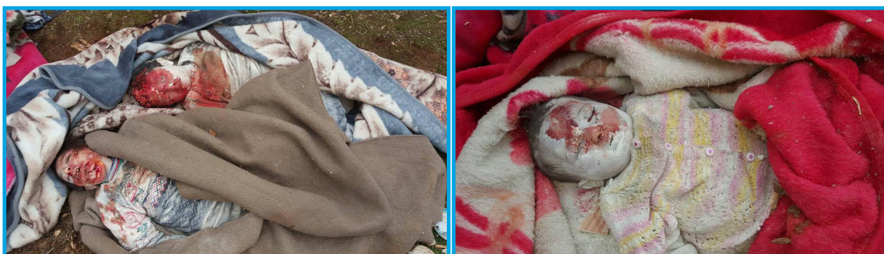
Children killed in an airstrike we believe was Russian on Kafr Joun village, Aleppo – January 30, 2017

Monday morning, January 30, 2017, fixed-wing warplanes we believe were Russian fired a number of missiles at Jam'ieyat Rif al Muhandiseen in Kafr Joun village, western suburbs of Aleppo governorate, which resulted in the killing of seven civilians at once (six children and one woman). The village was under the control of armed opposition factions at the time of the incident.