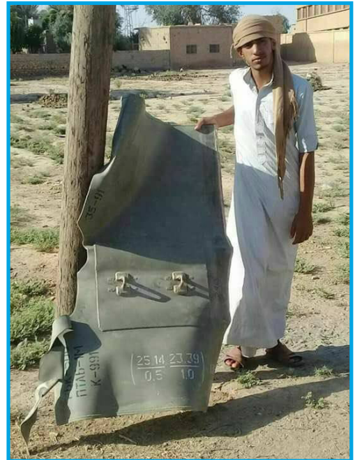
A cover of a cluster container found in Dablan town, Deir Ez-Zour suburbs in the aftermath of a Russian airstrike – June 28, 2017

Wednesday, June 28, 2017, fixed-wing warplanes we believe were Russian fired two RBK-500 missiles loaded with PTAB-1M cluster submunitions in Dablan town, eastern suburbs of Deir Ez-Zour governorate, which resulted in the killing of 24 civilians, including nine children and five women. Additionally, about 50 others were wounded. The town was under the control of ISIS at the time of the incident.