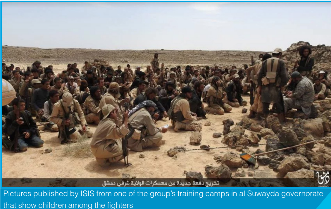
Pictures published by ISIS from one of the group’s training camps in al Suwayda governorate that show children among the fighters

ISIS was one of the groups that recruited children used them in direct and indirect military tasks, such as guarding, cooking, cleaning weapons and others. The group worked on promoting the idea of bearing arms among children as part of campaigns that aimed to train them, where ISIS opened a number of camps to train children on using weapons and other combat acts, and called them “Cubs Camps” which could be previously found in Raqqa governorate and al Bab city and currently in the group’s camps in Daraa governorate.